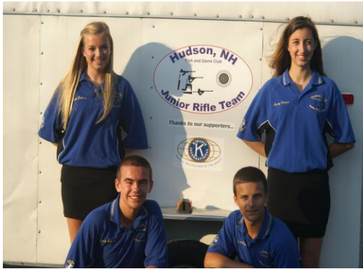
2013 National Matches Team Picture

Loaner Rifles / Spotting Scopes, etc. available for use in each class if needed.