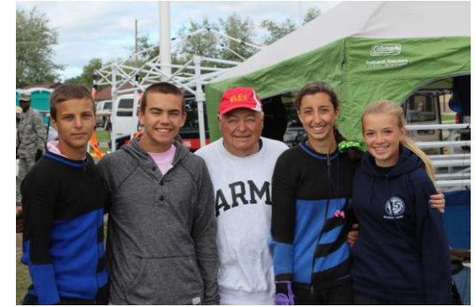
Junior rifle team with legendary Lones Wigger

Hot Cooked Breakfast & Lunch Items will be available at a very reasonable cost.